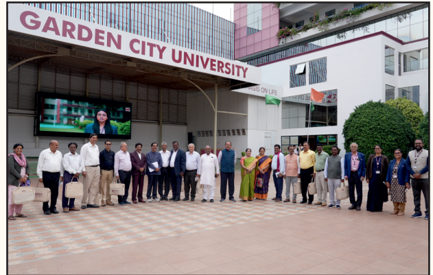
The team along with the advisory committee and the conference organizing team at the GCU Campus.