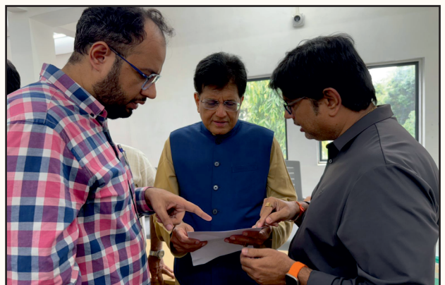
ICA Executive member inviting the Central Govt. commerce minister Shri. Piyush Goyal, Minister of Commerce and Industry